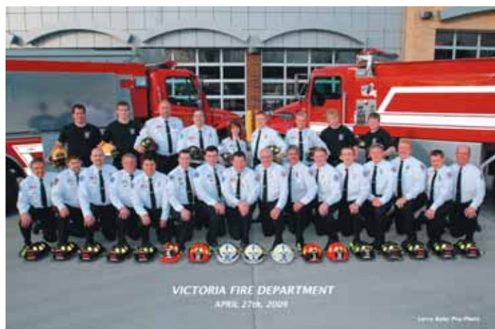
Victoria's volunteer firefighters logged more than 2,100 service hours in 2008.

In 2007 and 2008, the department responded to